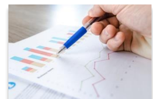
Comprehensive Product Information