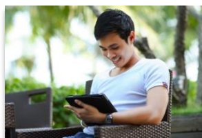
User Friendly Platform